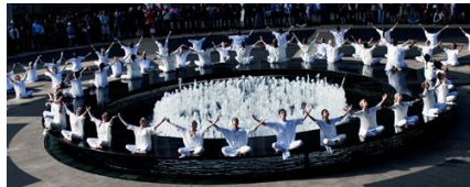
Table of Silence Dance Project

The anniversary of September 11th can be a time of interfaith peace and cooperation. How will you honor and commit to working for greater peace and harmony between faiths this 9/11? Religions for Peace USA invite you to the 9/11 Unity Walk , a one-mile interfaith peace walk in honor of September 11th tragedy. On September 8th from 3PM to 5PM, interfaith leaders from New York City will come together to reflect, walk and commit to continued cooperation and working for peace. The Walk will begin at St. Andrew's Roman Catholic Church (20 Cardinal Hayes Pl; Near Foley Square) and end with a 30-minute interfaith prayer service at the September 11th Museum and Memorial. There, ICNY's Rev. Chloe Breyer will give an address. Entrance into the memorial is provided by RFPUSA and tickets are limited. Please RSVP here .