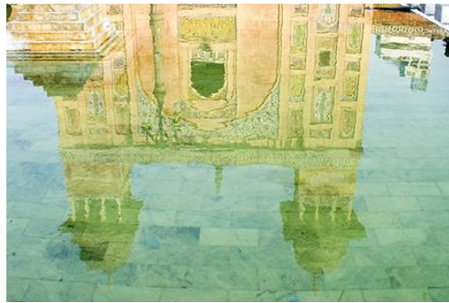
Exhibit Opening: Poetic Voices of the Muslim World

In a time of uncertainty and attacks on our communities, join us in Queens for a press conference and rally to show our love and pledge to defend each other. For more information, contact DRUM (Desis Rising Up and Moving) at 718.205-3036 or info@drumnyc.org . A flyer is available here.