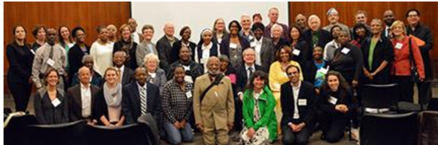
Religious and civic leaders in partnership at a past Marshall Meyer Retreat

Hospitality in a Time of Hate: Religious Leadership for an Inclusive City under the Trump Administration