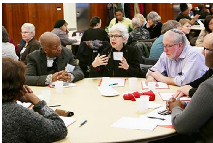
Faith leaders and service providers in conversation at the 2016 Social Work and Religious Diversity conference

Social Work and Religious Diversity: Religion, Spirituality, and Family Life