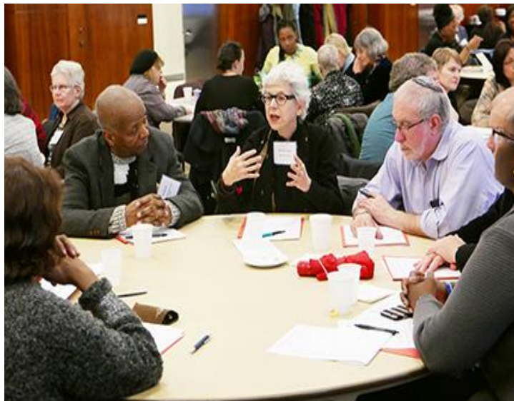
Faith leaders and service providers in conversation at the 2016 Social Work and Religious Diversity conference

Registration Now Open for a Full Day Conference on May 10, 2017 Seven Hours of Continuing Education for New York State LMSWs and LCSWs