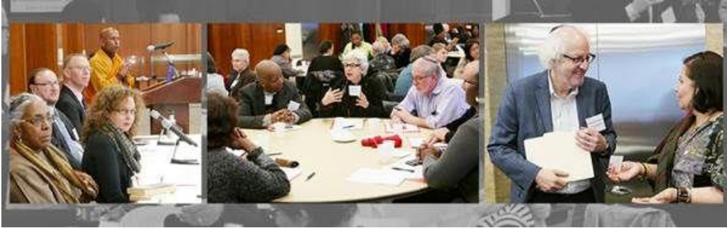
Faith leaders and service providers in conversation at the Social Work and Religious Diversity conference

Date/Time: Wednesday, May 10, 9:00 am - 5:00 pm