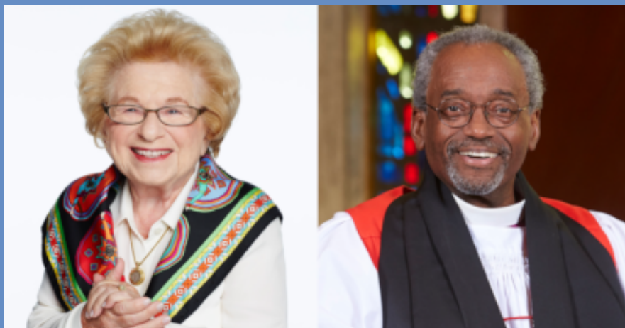
(From left: Dr. Ruth Westheimer & Presiding Bishop Michael Curry)