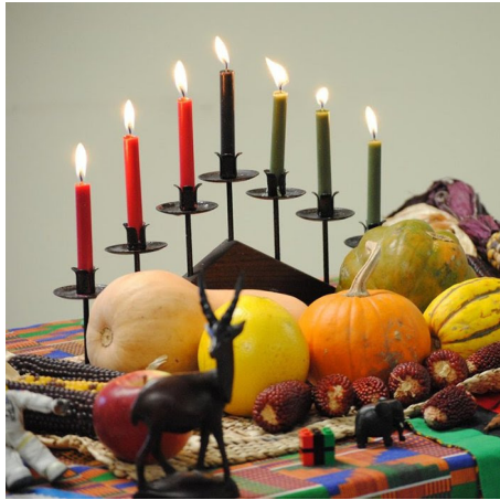
Kwanzaa (African American Heritage)