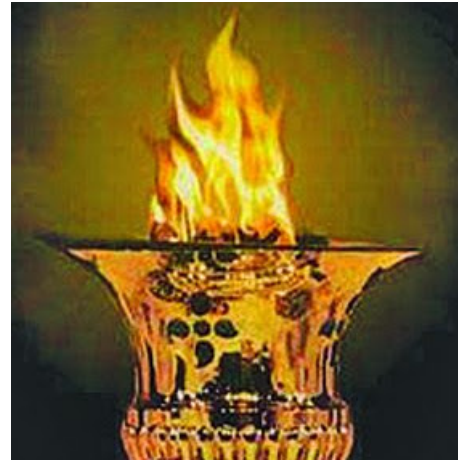
Zartosht No-Diso (Zoroastrian)