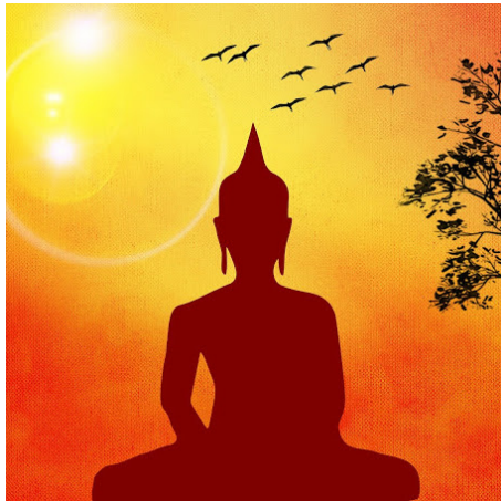
Bodhi Day (Buddhist)

Explore a few holy days happening this month.