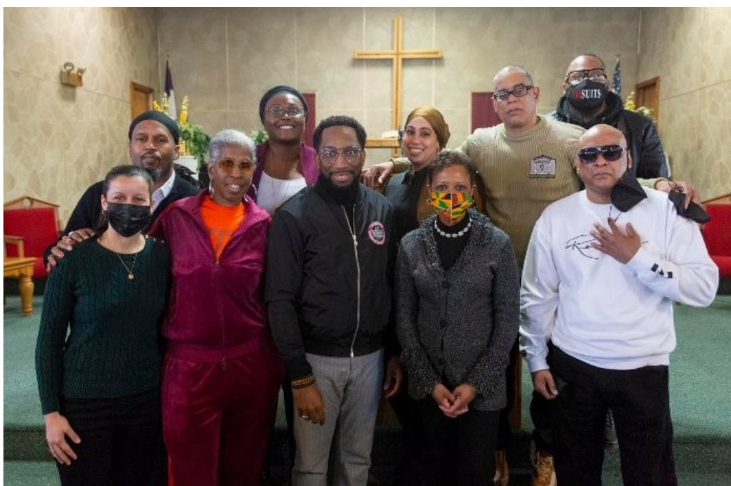
Black History Conversation on Faith & Safety at Praise Tabernacle Church: February 26th, 2022