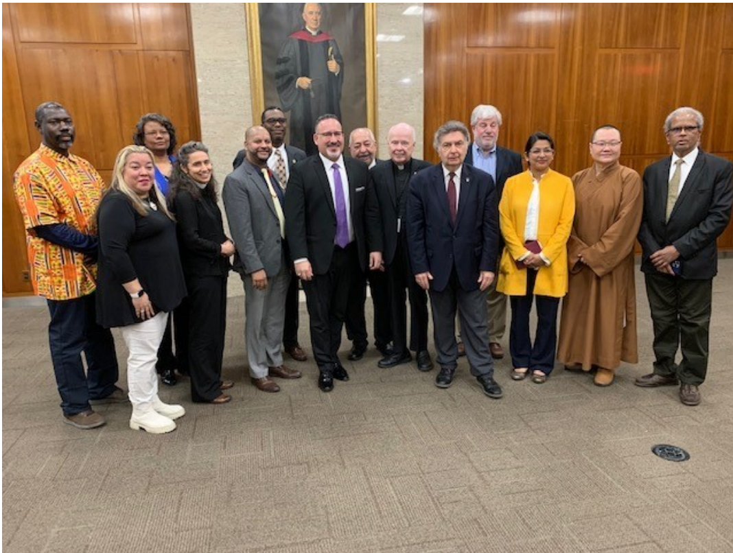
U.S. Secretary of Education Miguel Cardona with NYC Faith Leaders following roundtable discussion: March 18th, 2022