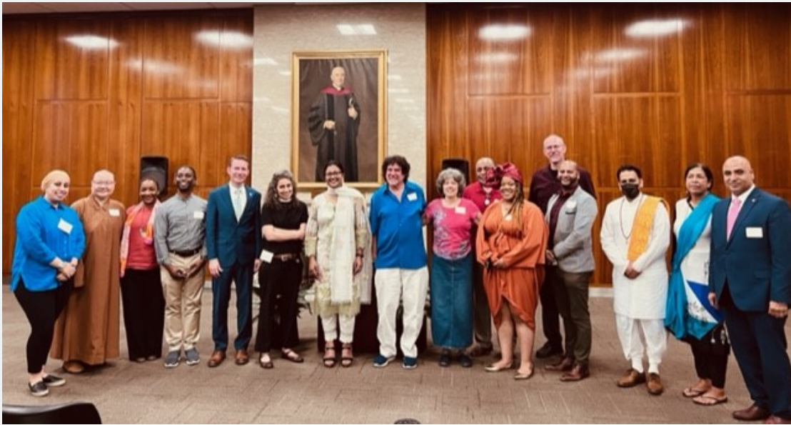
Graduation of 2022 Interfaith Civic Leadership Academy Cohort (6/29/2022)