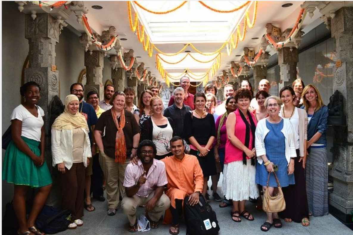
Past Summer Scholars Visiting the Hindu Temple Society of North America