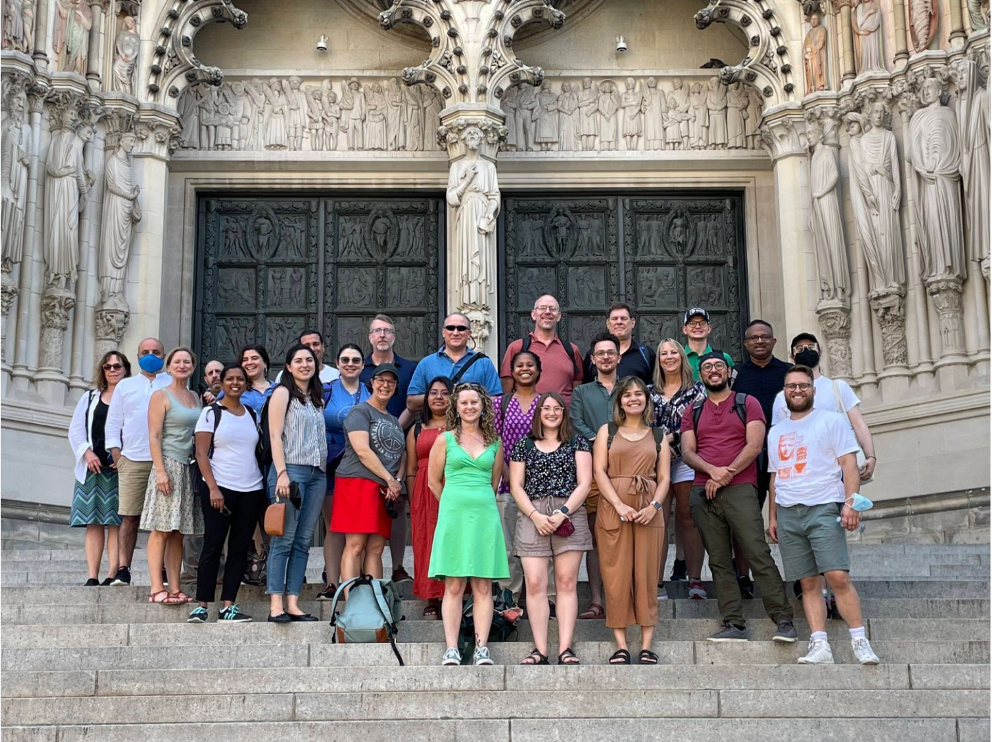
2022 Religious Worlds of New York Summer Institute Visits the Cathedral Church of Saint John the Divine