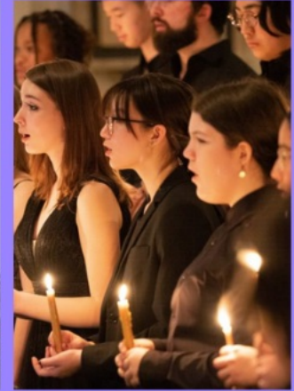
Trinity Youth Chorus →