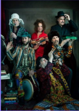
The Klezmatiks →