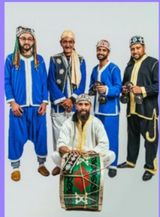
Innov Gnawa →