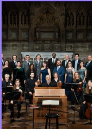
The Choir of Trinity Wall Street →