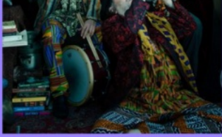
The Klezmatiks →