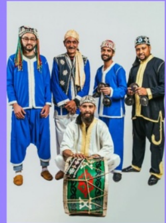
Innov Gnawa →