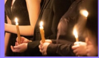
Trinity Youth Chorus →