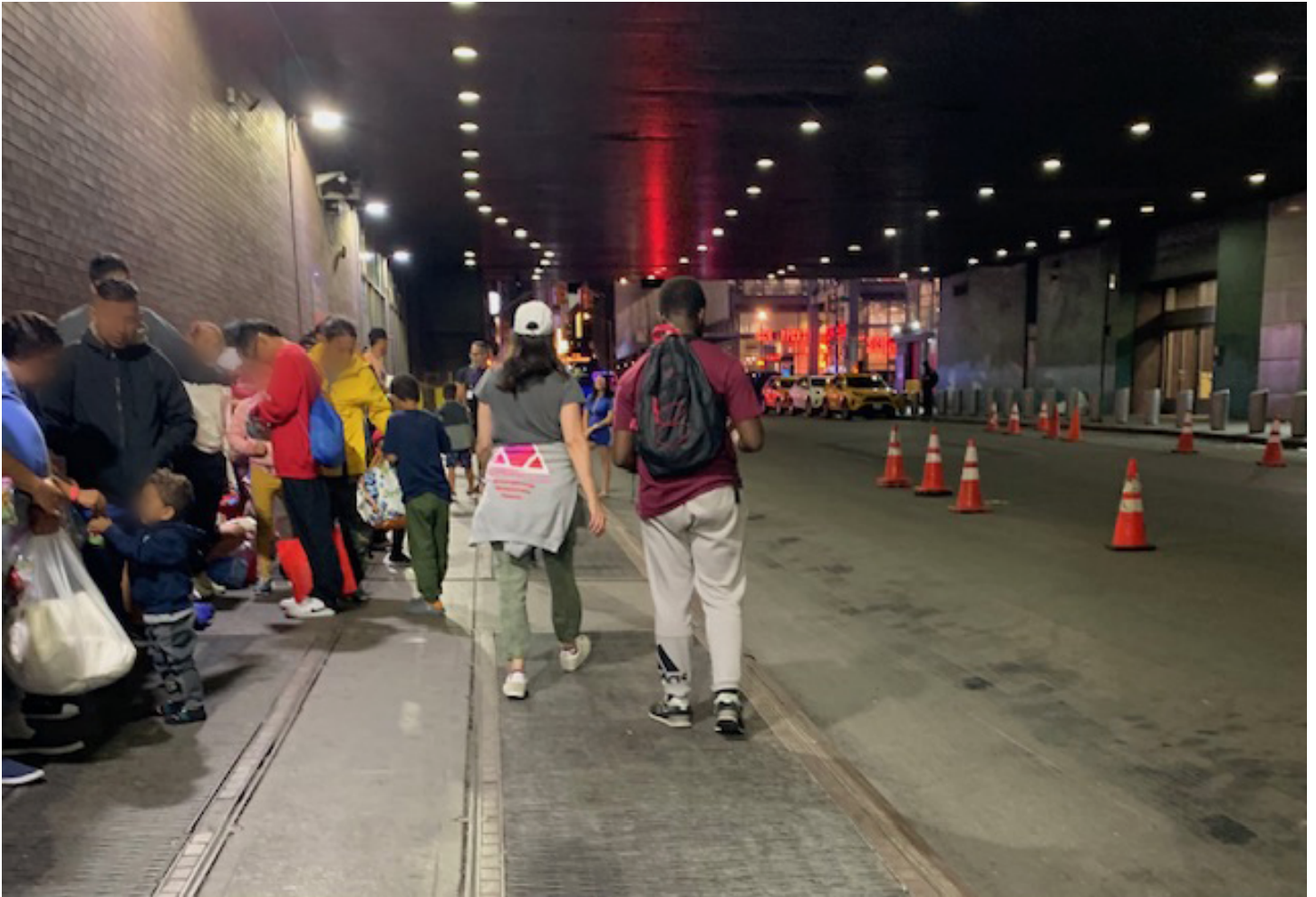
Newly Arrived Bus Passengers Disembark, New York City, August 2023