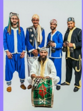
Innov Gnawa →