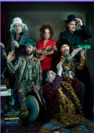
The Klezmatiks →