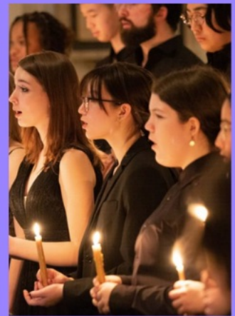
Trinity Youth Chorus →