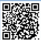
Asylum Seeker info

To inquire about how to be of service to our new neighbors in crisis with hospitality and safe sanctuary and covering your basic costs: