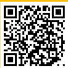
Asylum Seeker info

To inquire about how to be of service to our new neighbors in crisis with hospitality and safe sanctuary and covering your basic costs: