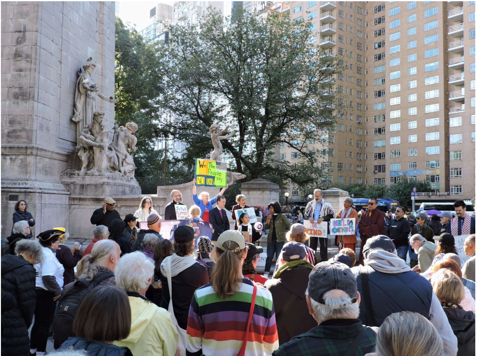
"No Kings" Interfaith Vigil, October 18th, 2025